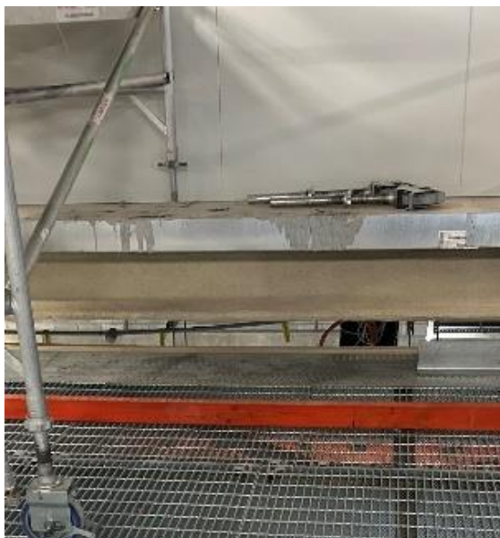
Steel kickboard angle being installed

The agreed documented process required that an exclusion zone was to be established below. On this occasion, the work activity was not planned to be undertaken on this day and proceeded without coordination with Lendlease.